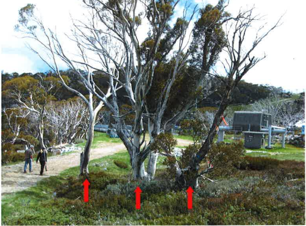
Photograph 2: The three trees proposed to be removed.

The applicant seeks development consent to remove three trees at the base of the Zali's ski run at Blue Cow, within the Perisher Range alpine resort.