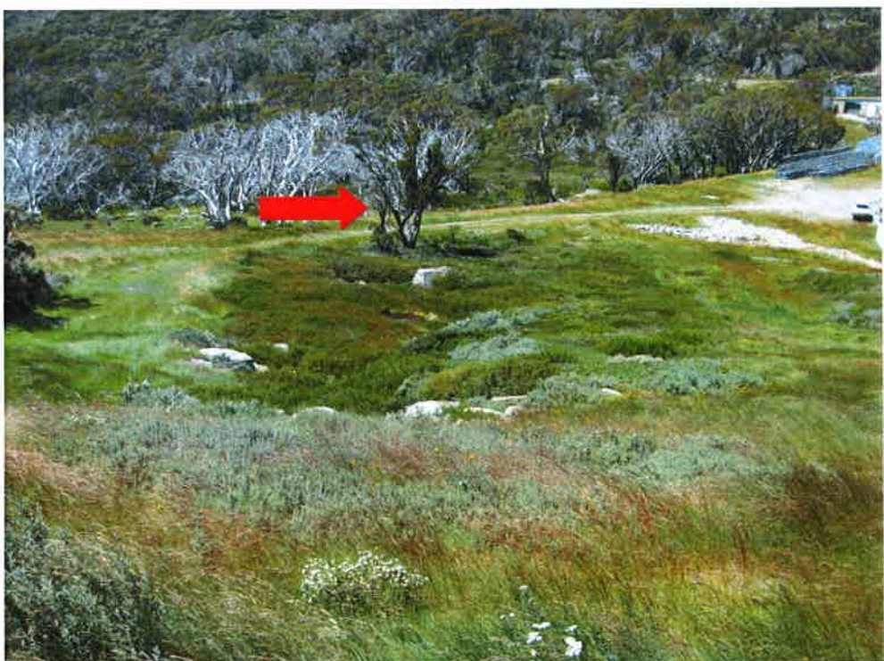
Photograph 1: View of the island of alpine bog at the base of the Zali's ski run, with the three trees to be removed marked.

The three trees proposed to be removed are located at the base of the Zali's ski run, on the edge of an island of alpine bog vegetation.